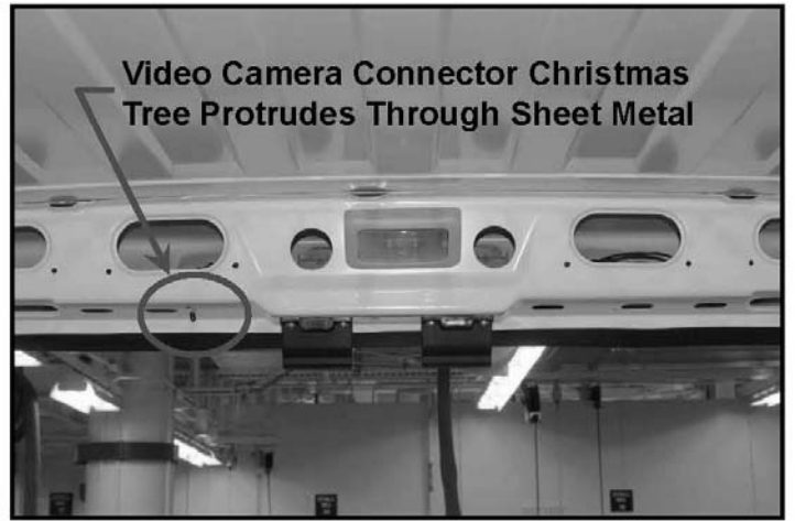
Video Camera Connector Christmas Tree Protrudes Through Sheet Metal